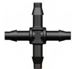
Cross 4.5 mm Barb