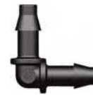
Elbow 4.5 mm Barb