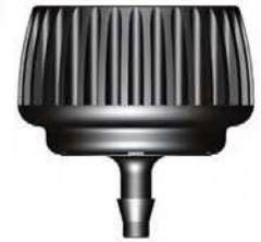
3/4" BSP Female Nut x 4.5 mm Barb