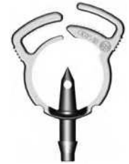
Micro Saddle OD16 - 18 with 4.5 mm Barbed Take-Off Adaptor