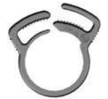
Ratchet Clamp OD16 - 18