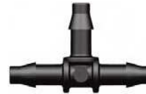
Tee 4.5 mm Barb