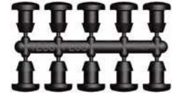
Repair Plugs (Rack of 10)