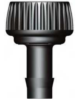
3/4" BSP Female Nut x 13 mm Barb