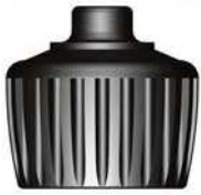
Adaptor Micro x 1/2" NPT Female