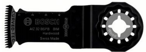
Image du produit, non emballé