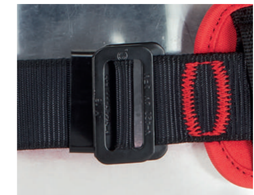
Pass through buckles