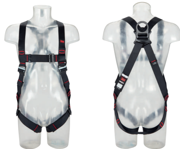
3M™ Protecta® Standard Vest Style Fall Arrest Harness