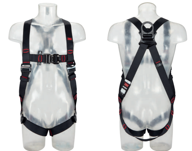
3M™ Protecta® Standard Vest Style Fall Arrest Harness