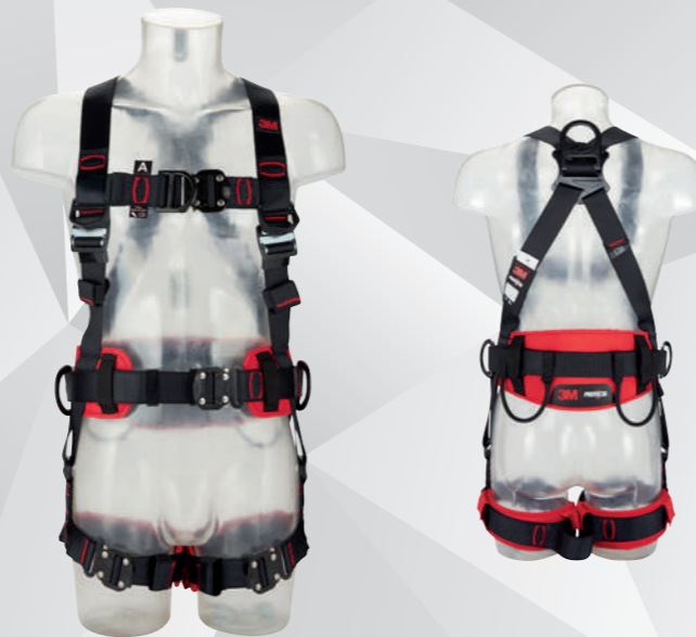
Comfort belt, horizontal leg straps