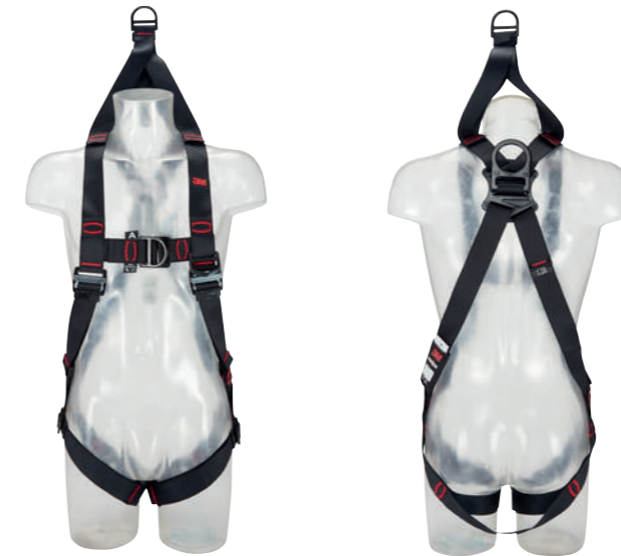
3M™ Protecta® Standard Vest Style Fall Arrest Rescue Harness