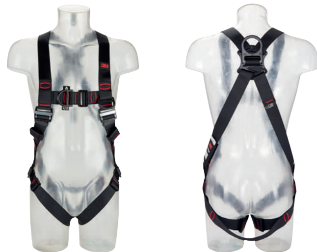
3M™ Protecta® Standard Vest Style Fall Arrest Harness