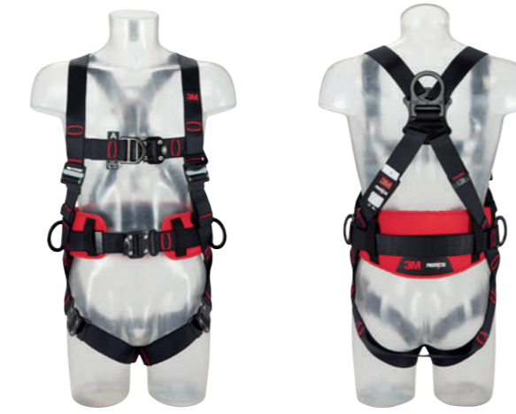
3M™ Protecta® Comfort Belt Style Fall Arrest Harness