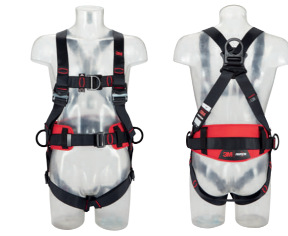
3M™ Protecta® Comfort Belt Style Fall Arrest Harness