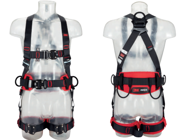
3M™ Protecta® Comfort Belt Style Fall Arrest Harness with Horizontal Leg Straps