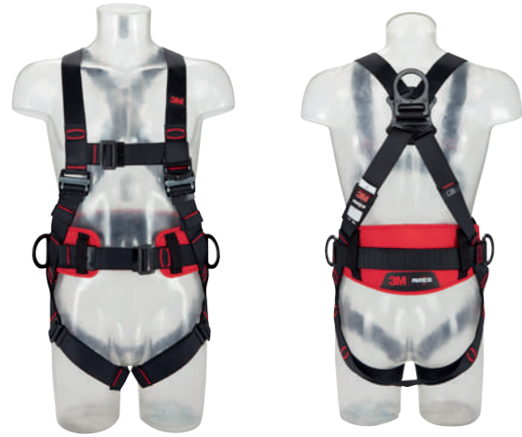
3M™ Protecta® Comfort Belt Style Fall Arrest Harness