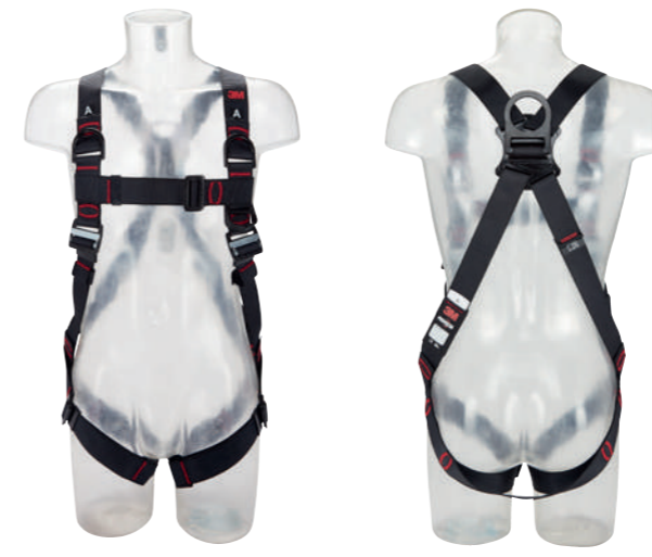
3M™ Protecta® Standard Vest Style Fall Arrest Harness