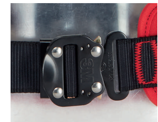
Quick connect buckles