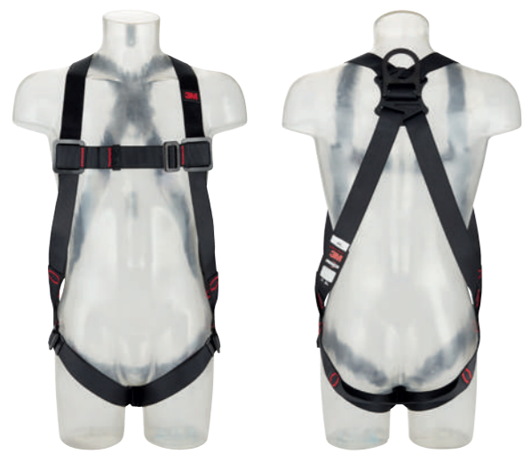
3M™ Protecta® Standard Vest Style Fall Arrest Harness