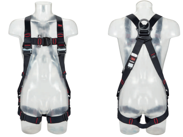
3M™ Protecta® Standard Vest Style Fall Arrest Harness with Horizontal Leg Straps