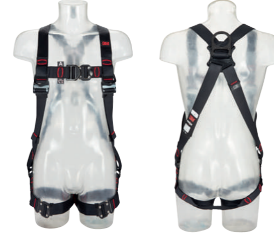
3M™ Protecta® Standard Vest Style Fall Arrest Harness with Horizontal Leg Straps