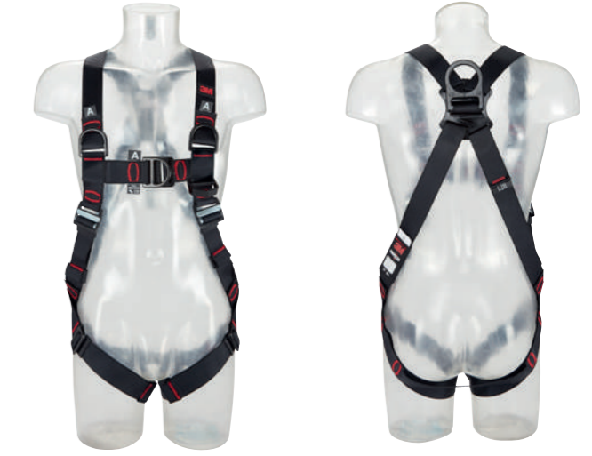
3M™ Protecta® Standard Vest Style Fall Arrest Harness