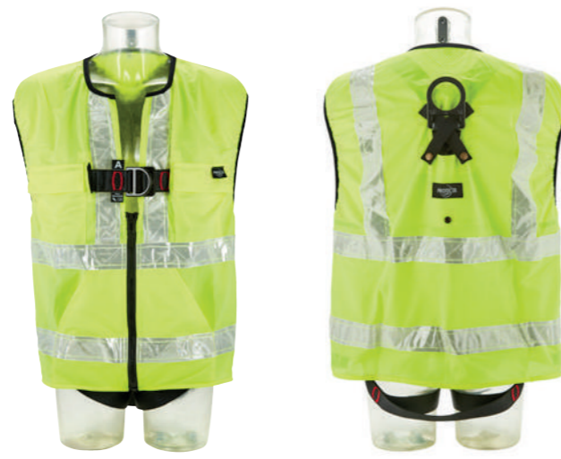
3M™ Protecta® Standard Vest Style Fall Arrest Harness with Hi-Visibility Vest